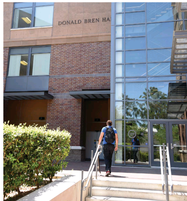
On campus: institute also educates government, private sector about cybercrime; trains law enforcement officers to investigate; establishes standards of proof; and conducts research