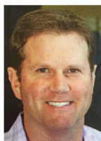
Zerkel: Vervys boosted payrolls 36%, expects growth to continue

It was expected to attract a sales price in the ballpark of $1.2 billion in its third sale in as many years.